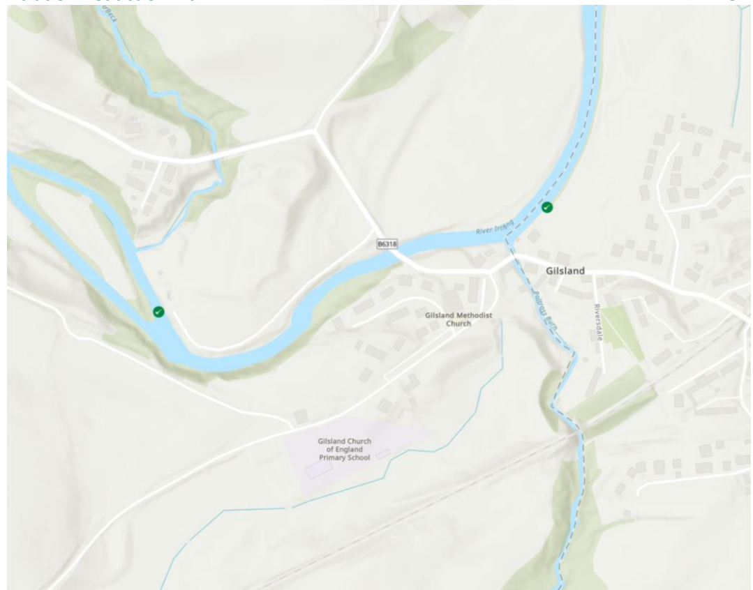
Figure 2: <u>United Utilities – Better Rivers – Storm Overflow Map</u> (November 2024). The green dot on the left of the image marks the Gilsland Wastewater Treatment Works Storm Overflow.

Gilsland is a village that straddles the Cumbria and Northumbrian border on the route of Hadrian's wall. The River Irthing borders the village to the North with its tributary, Poltross Burn, flowing through the village.