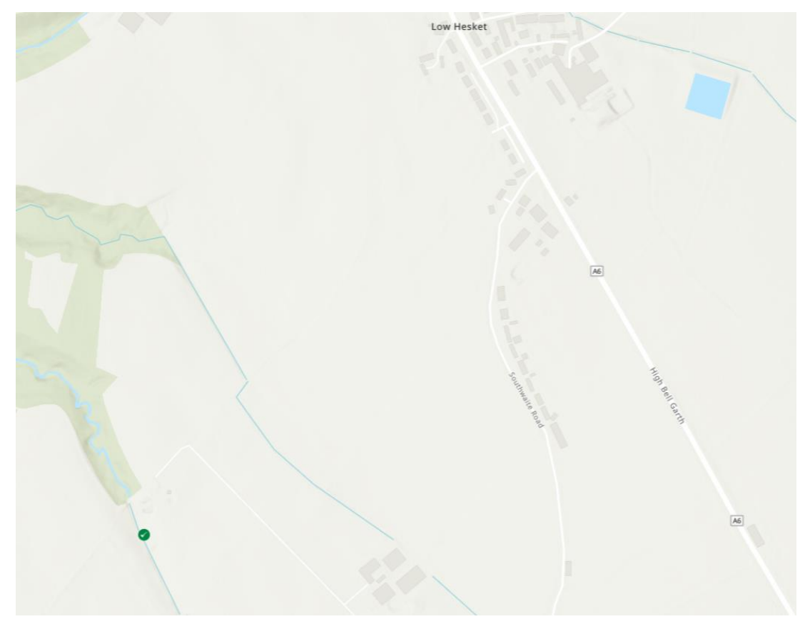
Figure 2: <u>United Utilities – Better Rivers – Storm Overflow Map</u> (October2024). The green dot marks the Low Hesket WwTW Storm Overflow.

The village of Low Hesket shares a catchment area with High Hesket to the south. It lies east of the River Petteril with Barrock Gill flowing through the village.