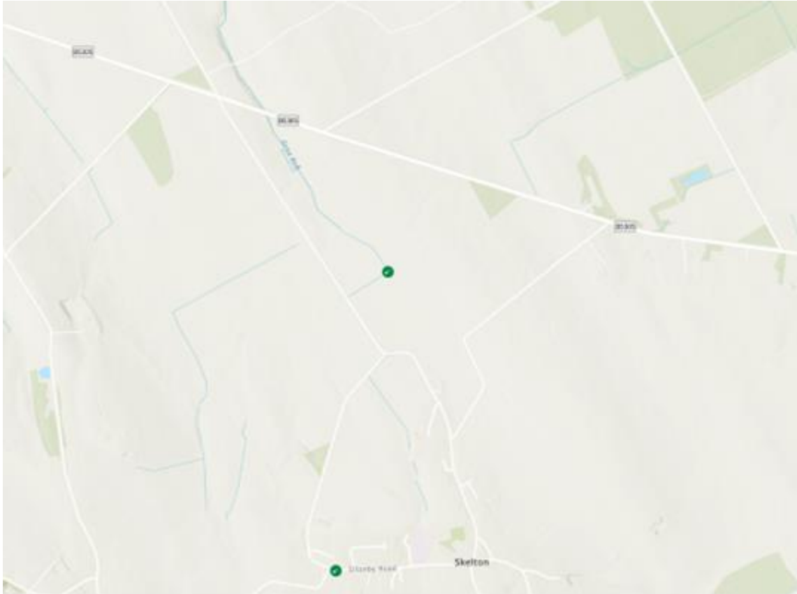
Figure 2: United Utilities – Better Rivers – Storm Overflow Map (October 2024). The green, most northerly dot, marks the Skelton WwTW Storm Overflow.

Skelton, North East Cumbria, is a small village and civil parish that lies around 6km outside the Lake District National Park Boundary, northwest of Penrith in close proximity to Grise Beck.